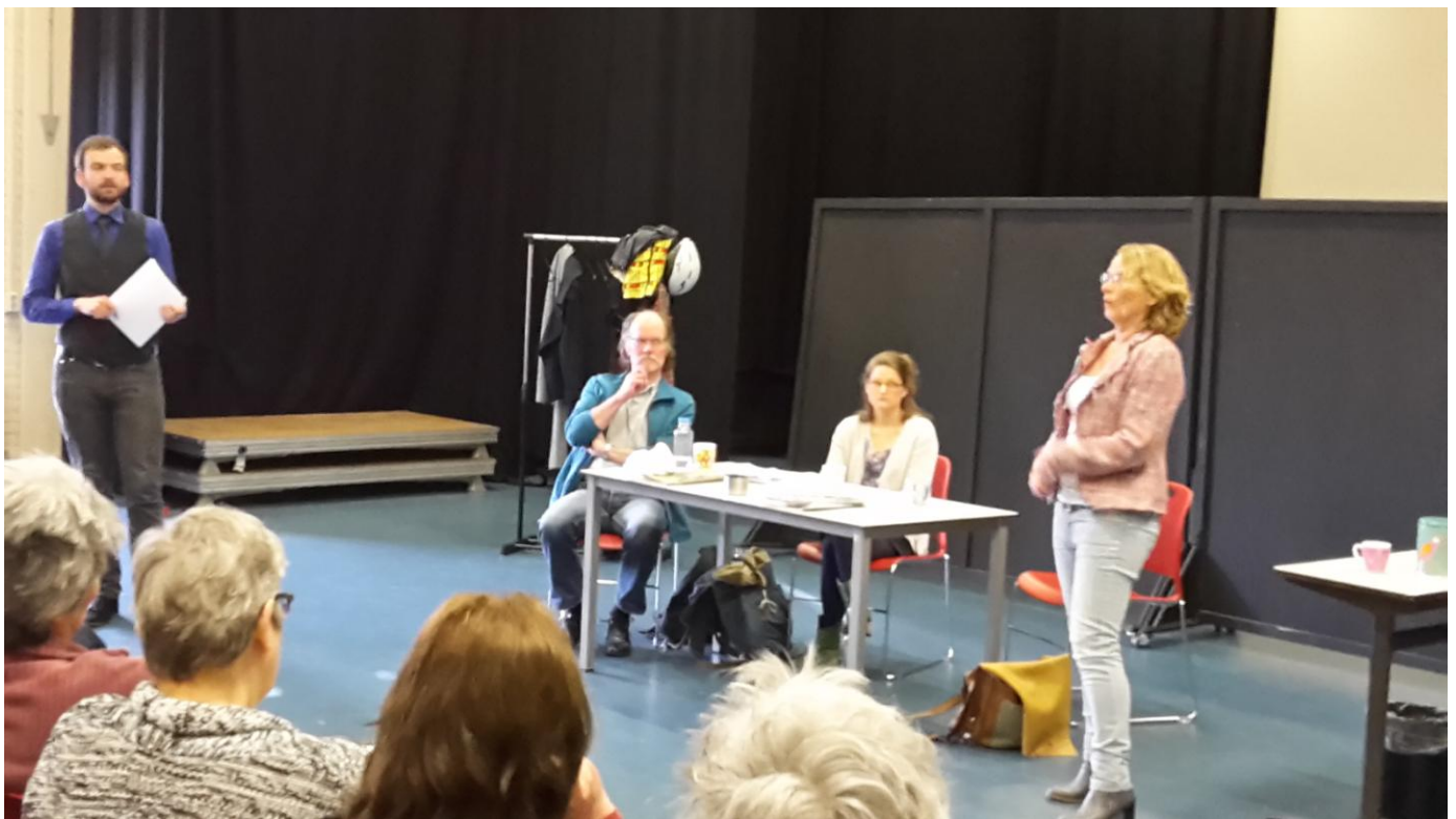
Image: in the Dutch national "VET and sexual diversity project", interactive theatre group "AanZ" plays a scene in the staff room. In the scene, the manager is confronted with a lesbian teacher demanding the school changes policy, but the manager shifts between agreeing with the lesbian teacher and a conservative teacher. The audience has to give her suggestions how to improve her management in this situation. The interactive play is a kick-off of a day teacher training and a follow-up consultancy to integrate adequate attention to sexual diversity in the school policy.

Sources: ECBO , EduDivers on VET monitor , EduDivers on VET project , Dutch description VET project