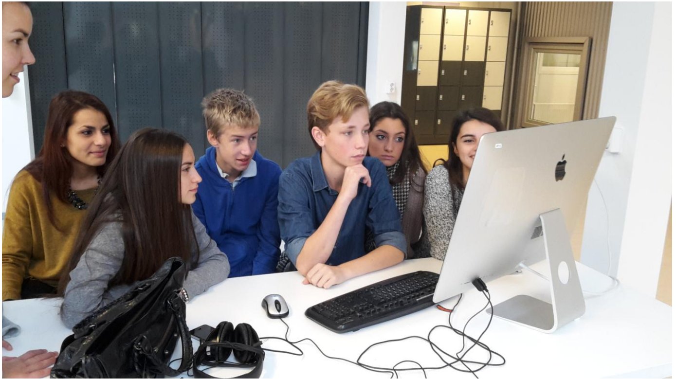
Image: student edit their own education film about sexual diversity

recommendations and then adjust them based on suggestions from teachers, parents and experts. The brochure describes how high school students can make their own education film, how to analyze the school safety, how to organize an interactive school conference and how to integrate LGBTI issues in a curriculum on citizenships skills and human rights.