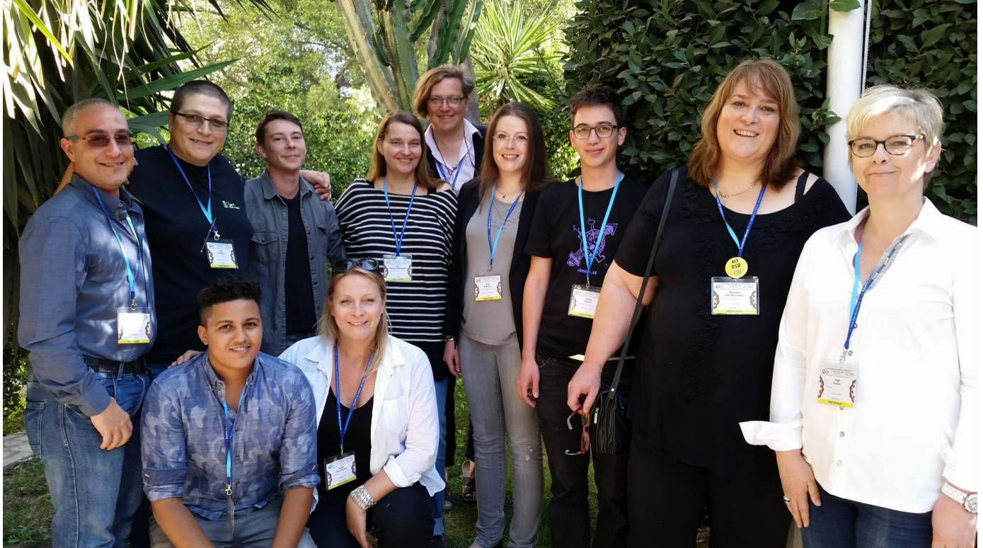
Image: the board of OII Europe

For some time, intersex people were ambiguous about being connected to the LGBT movement. Many of them see themselves as "having an intersex condition", which is not, or they do not want to view as an important part of their identity. Joining an identity based movement could be seen as a risk. But recently, intersex organizations have begun to cooperate when they saw that a good cooperation between the LGB and T organizations could lead to real legal and social benefits for transgender persons.