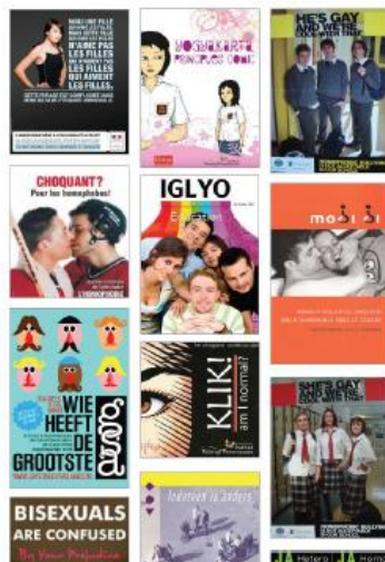
Image: poster used to inform participants of the UNESCO NGO Conference