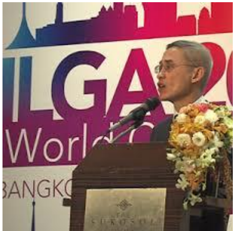
Image: Vitit Muntarbhorn giving a keynote speech at the ILGA World Conference in Bangkok, November 309 (photo ILGA World).

19 December 2016 - The new independent expert on Protection against Violence and Discrimination based on Sexual Orientation and Gender Identity remains in function. This became clear after a second attack of a block of 77 countries. Vitit Muntarbhorn held a keynote speech at the ILGA World Conference in Bangkok, where he outlined that he will take his mandate to not only include physical violence but also to other forms of violence common in schools.